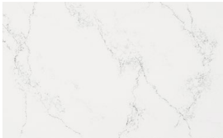
Empira White™ 5151