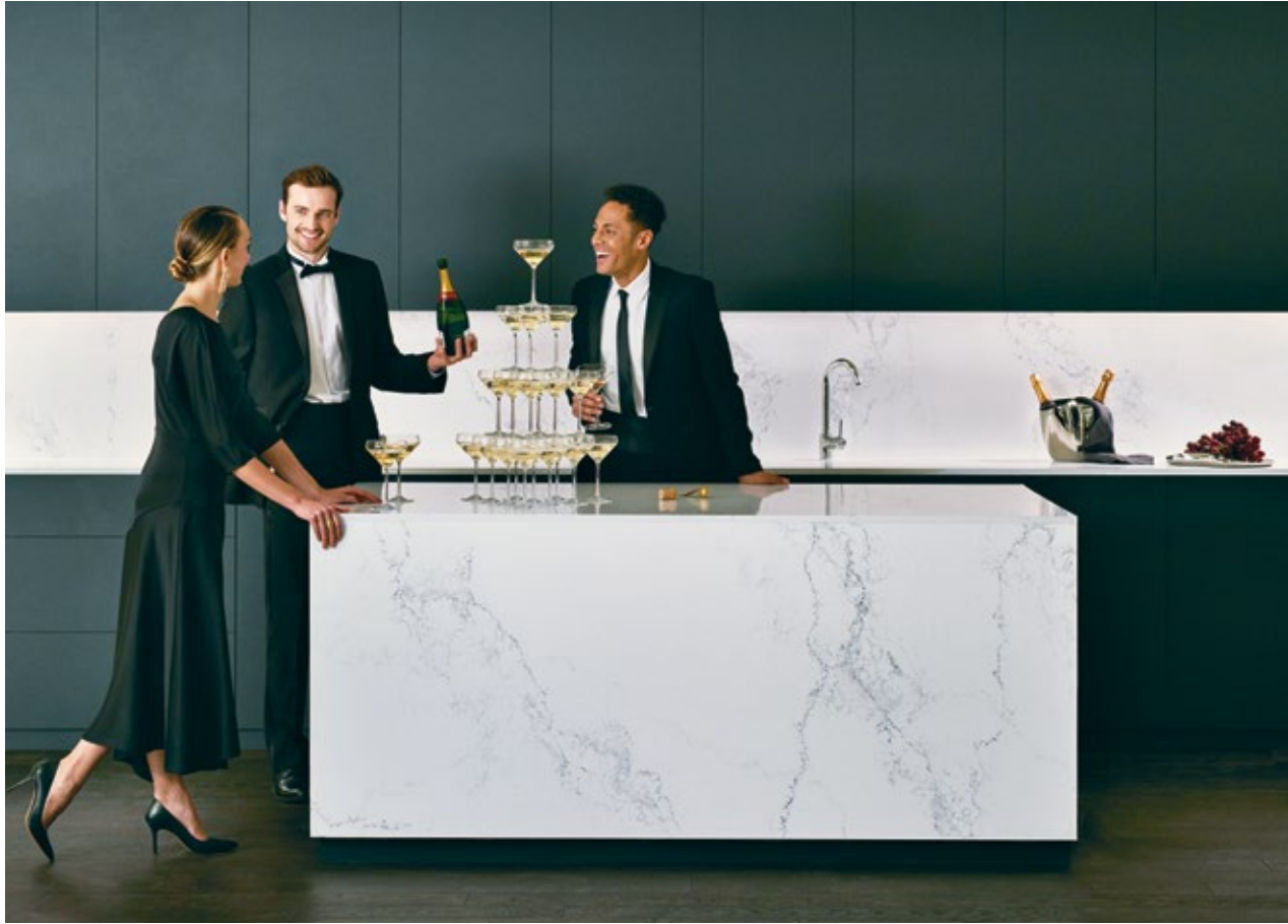
Marsh House by LSA Architects