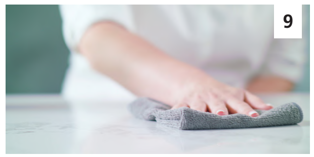
Rinse and repeat several times to ensure all excess suds are removed.

Remove all excess suds, rinsing the surface with warm water and a microfibre cloth or soft clean towel.